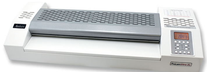
Ultra-XL (Extra Large 18.9" Opening)