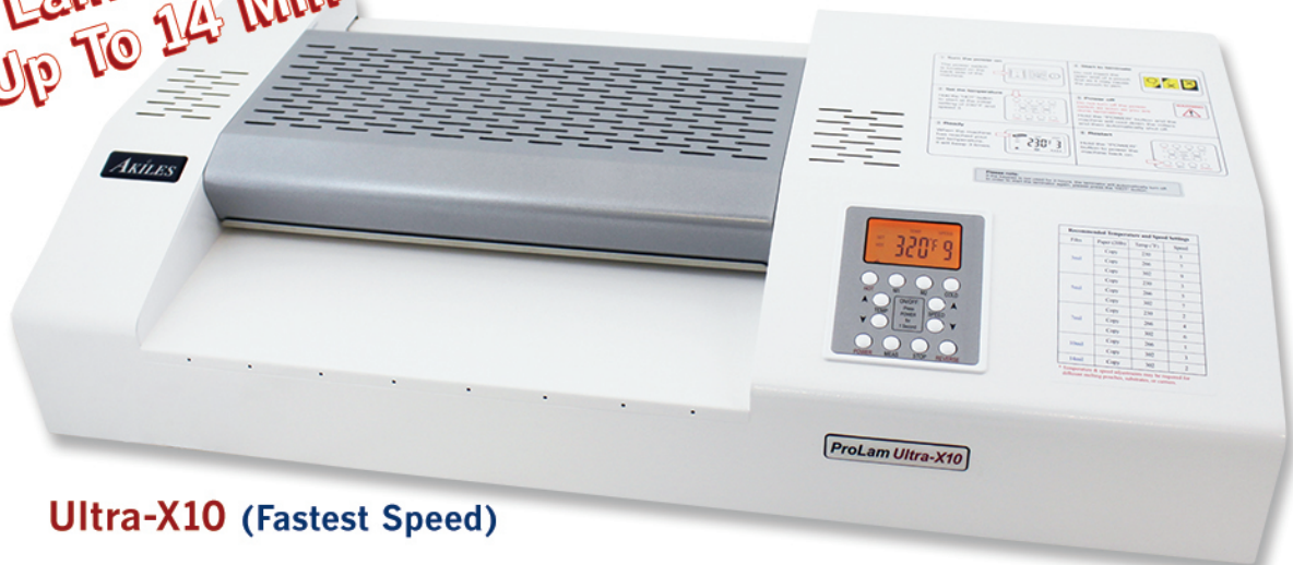
Ultra-X10 (Fastest Speed)