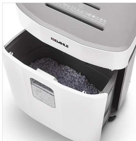
The 7 gallon waste bin features a clear window to view shred level and is easy to empty.