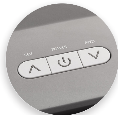
Convenient, easy-to-use controls for simple operation.