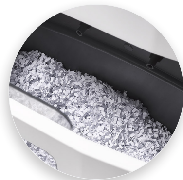
Security Level P-4 for the destruction of confidential documents.