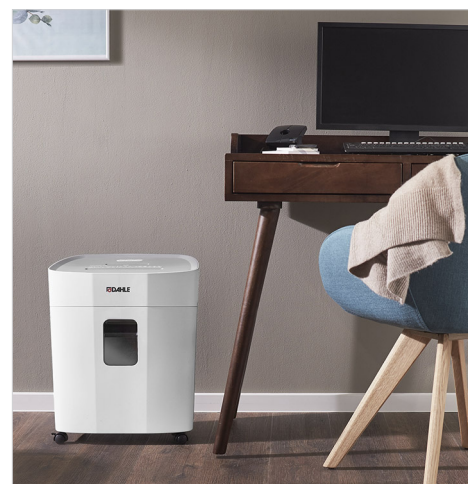
Compact size makes it easy to place the shredder wherever you need it most.