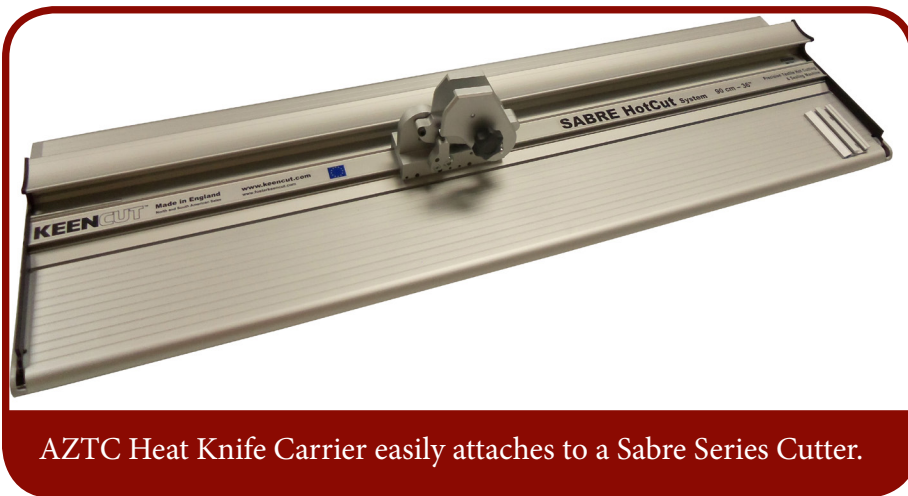
AZTC Heat Knife Carrier easily attaches to a Sabre Series Cutter.

MyBinding.com 5500 NE Moore Court Hillsboro, OR 97124 Toll Free: 1-800-944-4573 Local: 503-640-5920