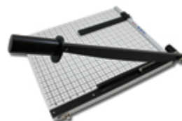
Offi Trim Plus 1512