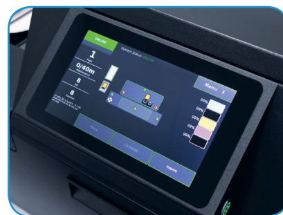
Full-color touchscreen control panel