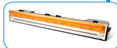
Memjet Inkjet Print Head features 74,000 nozzles and no moving parts