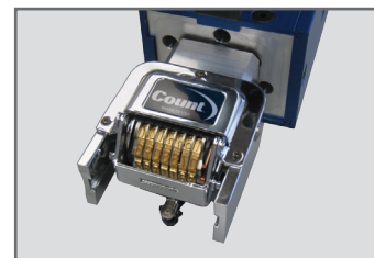
Numbering Head Wheel With Font Style Gothic (7)

The COUNT™ TableMatic Plus offers an easy, economical numbering solution that's ideal for small jobs that turn quickly. The TableMatic Plus can be used for crash numbering of NCR forms up to 6 parts, or numbering virtually anywhere on the paper. The simple foot pedal operation means anyone in your shop can use it, yet offers a range of features: drop zeros, a repeat function, numbering head pressure adjustment and a patented self-inking cartridge. Plus, a magnetic backstop and built-in side rails ensure consistently accurate registration.