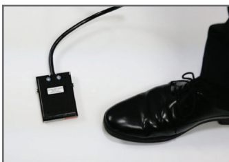
Simple Foot Pedal Operation

This simple-to-use numbering solution accommodates small jobs for quick delivery to your customers.