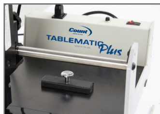
Magnetic Back Stop