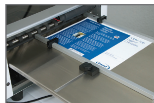
One Step Feed