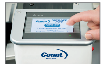
Touch Screen Controller

The COUNT™ iCrease Pro is a simple yet robust solution for creasing of digital media to eliminate cracking when folding. The iCrease Pro gives you the automation of bigger COUNT machines in a simple hand-feed machine anyone can use.