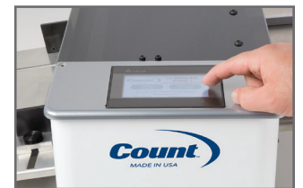
Touch Screen Controller

The COUNT™ iCrease Pro + is a robust solution for creasing and perforating digital media to eliminate cracking when folding. Get the automation of bigger COUNT machines in a simple hand-feed machine anyone can use. The iCrease Pro + can crease and perf in one pass (no need to refeed!), with multiple crease locations and perfect bind covers, with choice of automatic hinge placement or no hinge.