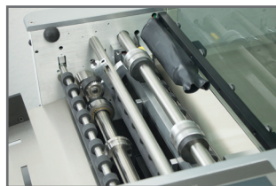
CAM Actuated Compression Creasing

Combines creasing and perforating in one simple yet powerful machine.