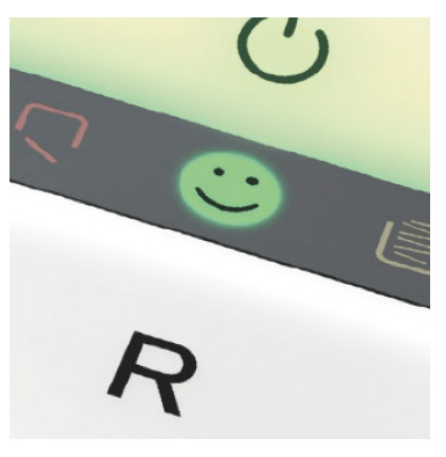
SSC - SMART SHRED CONTROL

Only environmentally friendly, lead-free soldering is used in the production of our electrical components.