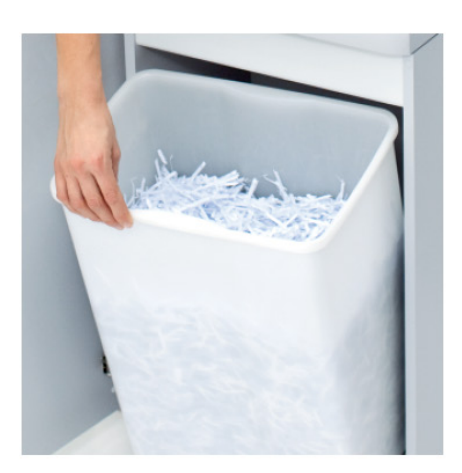
ENVIRONMENTALLY FRIENDLY BIN

Electronically controlled, transparent safety shield keeps fingers out of the feed opening.