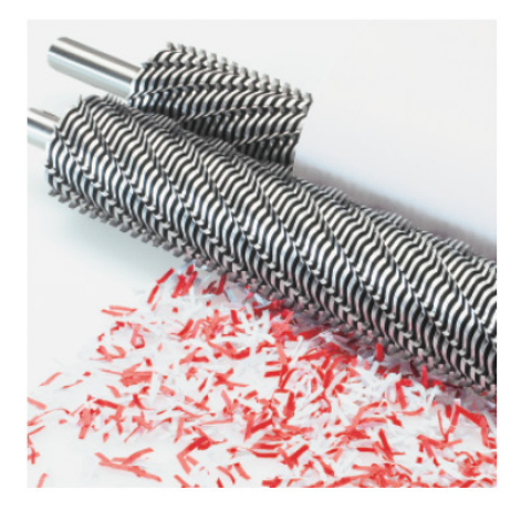
SOLID STEEL CUTTING SHAFTS

High grade, hardened steel cutting shafts are milled in our Balingen factory and warranted for life.1