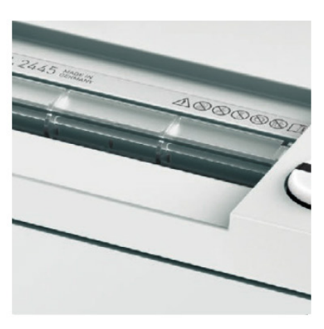
PATENTED SAFETY SHIELD

Multifunction control element uses optical signals to indicate operational status and functions as an emergency stop switch.