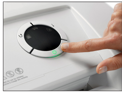
The command dial controls power up, reverse, and continuous run functions.