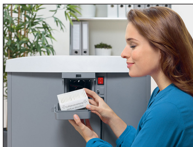
The CleanTEC® filter traps up to 98% of the fine dust and provides a healthier work environment.

This shredder automatically powers down after 30 minutes of inactivity. It will appeal to those interested in conserving energy as well as reducing electrical costs.