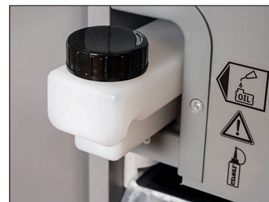
The EvenFlow Lubricator provides continuous lubrication and ensures peak performance.