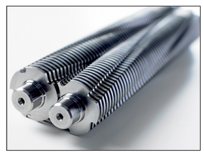
The cutting cylinders are milled from a solid bar of German Solingen steel for strength.