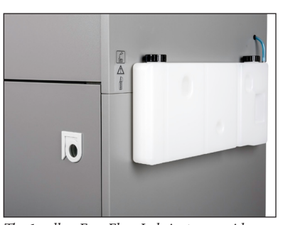
The 1 gallon EvenFlow Lubricator provides continuous lubrication for peak performance.

-Automatic On/Off for quick & easy power up -Bin Full Auto-Off for bag change notification