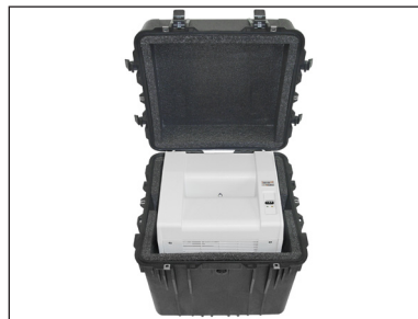
This shredder comes equipped with a high impact plastic mobility case for easy transit.