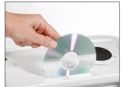
This shredder features a built-in user-friendly opening for CD and DVD destruction.