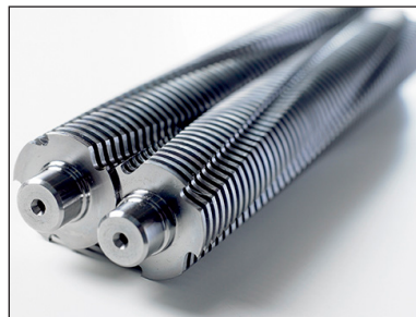
The cutting cylinders are milled from a solid bar of German Solingen steel for strength.