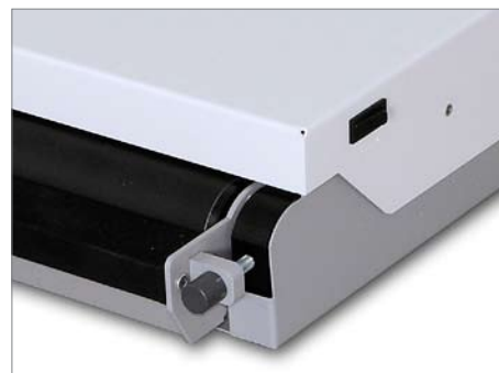
The integrated edge folding unit is adjustable for different cover board thicknesses.