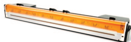
Memjet® print head has 70,400 ink nozzles for higher speeds, lower ink use and less noise than standard print heads

Fixed Print Head: Single 8.77" bar spans the width of the printing surface