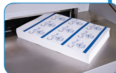
Low-friction work table and extra-large side tables help operators process large and/or heavy paper stacks with ease

MyBinding.com 5500 NE Moore Court Hillsboro, OR 97124 Toll Free: 1-800-944-4573 Local: 503-640-5920