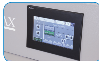
Touchscreen control panel allows for programming up to 100 jobs