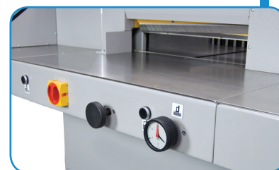
Two-button operation, fine-tune knob, adjustable hydraulic pressure gauge