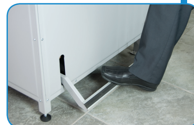
Foot pedal pre-clamp holds paper to check alignment prior to cutting