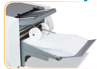
Integrated Output Conveyor

The FD 1502 Plus is built with proven Formax technology. Heavy-duty steel construction offers the dependability and power expected of a larger unit in a smaller package. A hopper capacity of up to 200 forms and processing speed of up to 6,250 forms per hour enables an operator to complete daily jobs in no time. Plus, the integrated output conveyor keeps processed forms in a neat, sequential order.