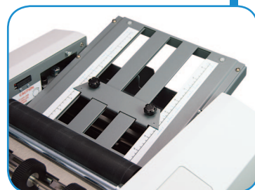
Clearly marked fold plates are easy to adjust