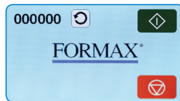
Touchscreen control panel is graphics-based making it easy to use