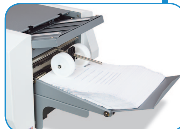
Integrated output conveyor keeps processed forms neat and sequential