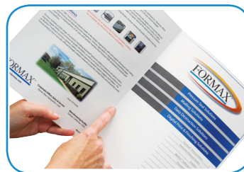
Sheet is creased and ready for crack-free folding