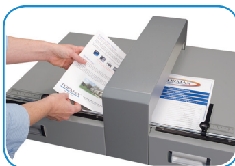
Load sheet to be creased