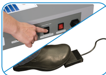
Choose either push-button or foot-pedal operation