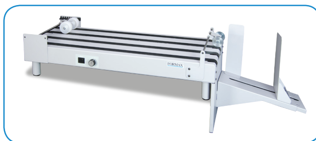
FD 282-30 Drop-Stacking Conveyor

MyBinding.com 5500 NE Moore Court Hillsboro, OR 97124 Toll Free: 1-800-944-4573 Local: 503-640-5920