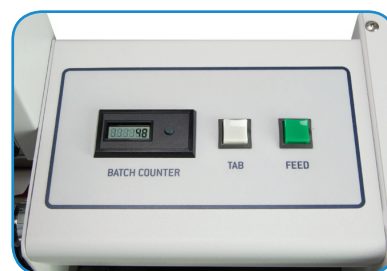
Simple, push-button controls and resettable LCD counter