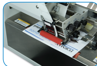
Applicator and rollers ensure tab is tightly folded and sealed