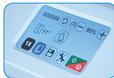
Large color touchscreen