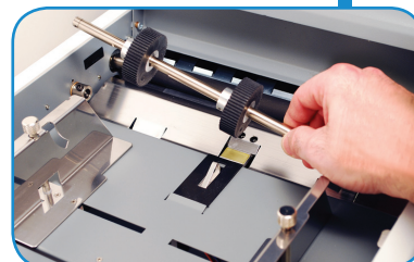
Removable Feed Wheels