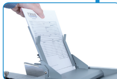
Optional Multi-Sheet Feeder