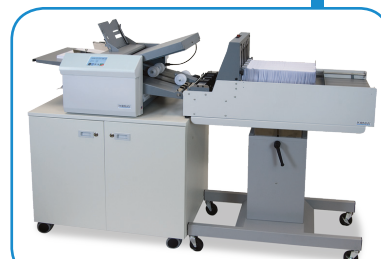
FD 386 in-line with optional V-Stack36i Vertical Stacker, multi-sheet feeder, stand and cabinet

MyBinding.com 5500 NE Moore Court Hillsboro, OR 97124 Toll Free: 1-800-944-4573 Local: 503-640-5920