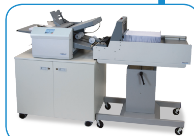
FD 38Xi in-line with optional V-Stack36i Vertical Stacker, stand and cabinet

MyBinding.com 5500 NE Moore Court Hillsboro, OR 97124 Toll Free: 1-800-944-4573 Local: 503-640-5920