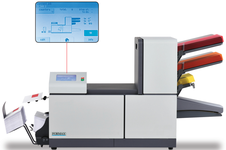
FD 6204-Advanced 2