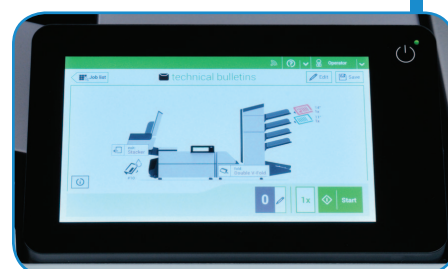
Color Touchscreen Control Panel with graphical interface