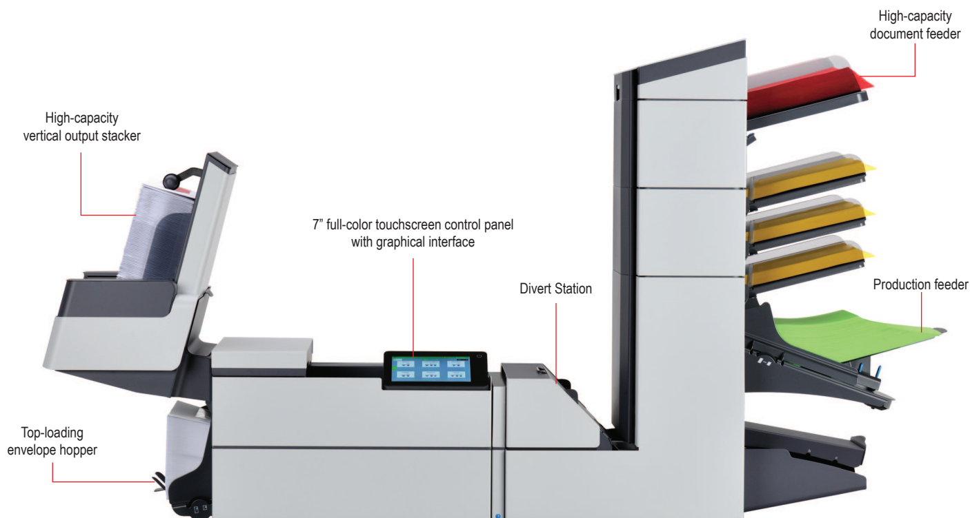
6406 Series, shown with optional High-Capacity Document Feeder and Production Feeder

The versatile 6406 Series can be configured to accommodate a range of folding and inserting applications. Models are available with 2 to 6 stations for flexibility, and include a variety of input configurations: a high-capacity document feeder for up to 725 sheets, 1 or 2 high-capacity production feeders, standard and special feeders, and short feed trays.