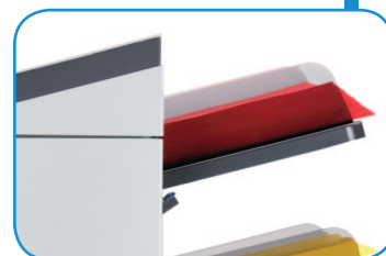
High-Capacity Document Feeder