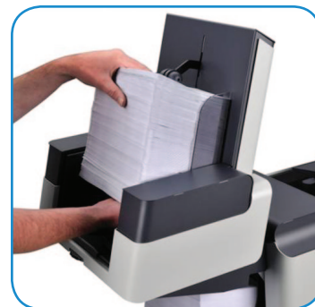
High-Capacity Vertical Output Stacker