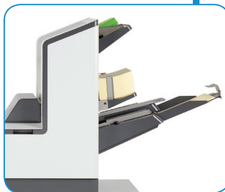
Tower Feeder with Accumulation/Divert Deck