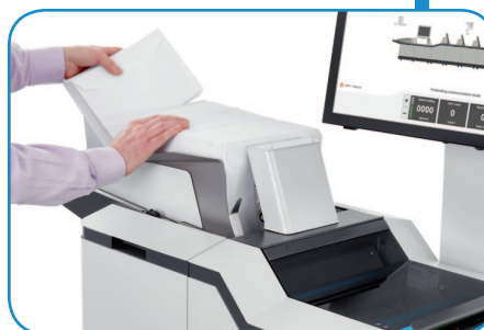
High-Capacity Envelope Feeder