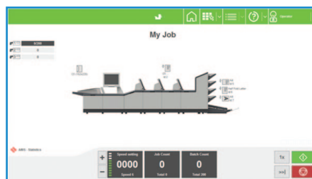
22" Color Touchscreen Interface

Daily Mail Mode: Feed stapled or unstapled sets simply by opening the accumulator