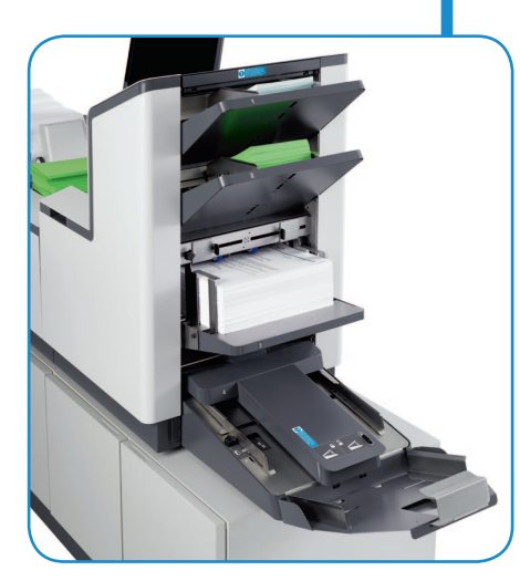
Tower Feeder with High-Capacity Trays and Accumulation/Divert Deck

MyBinding.com 5500 NE Moore Court Hillsboro, OR 97124 Toll Free: 1-800-944-4573 Local: 503-640-5920