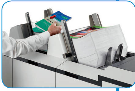
High-Capacity Versatile Feeders - redesigned for easier loading