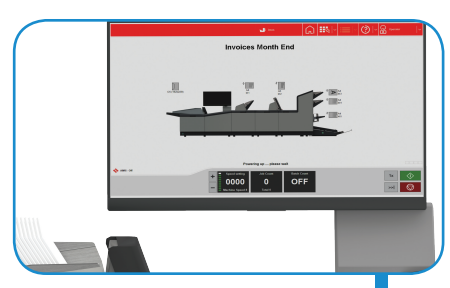
22" Color Touchscreen Interface