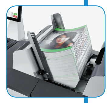
Versatile Insert Feeder