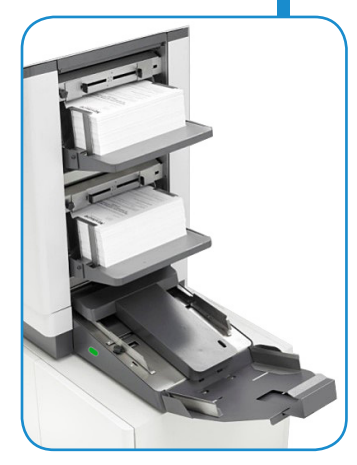
Tower Feeder w/ High-Capacity Trays and Accumulation/Divert Deck

Formax - New Hampshire, USA www.formax.com Local Dealer: