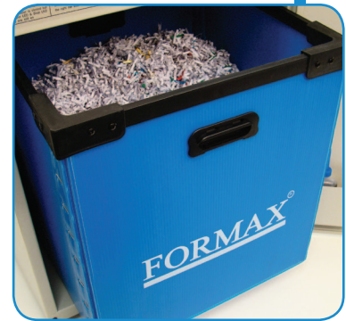
Lifetime Guaranteed Heavy-Duty Waste Bin