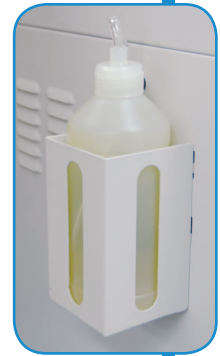
Optional EvenFlow™ Automatic Oiling System

MyBinding.com 5500 NE Moore Court Hillsboro, OR 97124 Toll Free: 1-800-944-4573 Local: 503-640-5920