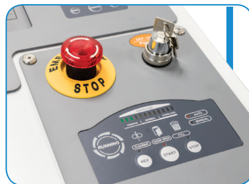
LED control panel, safety key lock and large emergency stop button

* Capacity may vary due to variations in power supply.