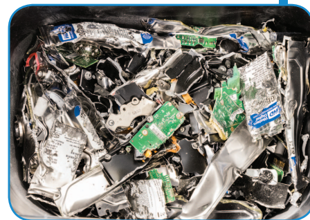
Shredded particles fall into the molded plastic waste bin for easy storage and disposal

MyBinding.com 5500 NE Moore Court Hillsboro, OR 97124 Toll Free: 1-800-944-4573 Local: 503-640-5920