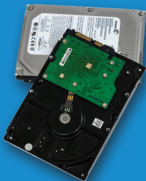
Desktop Hard Drives