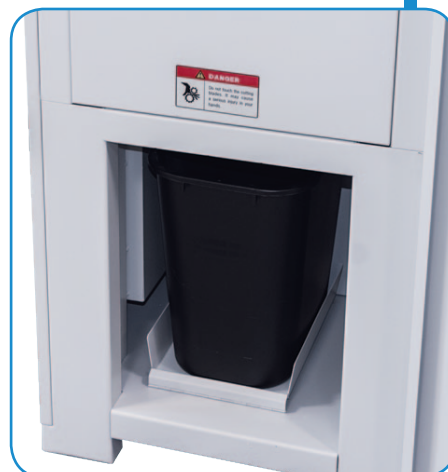
Rugged molded plastic waste bin for convenient storage and disposal