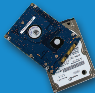
Laptop Hard Drives