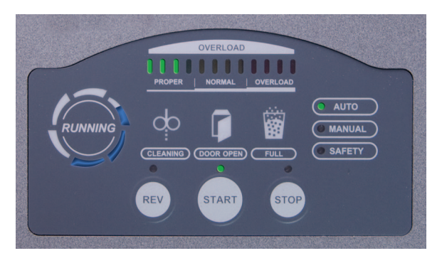
LED control panel with visual load indicator

The FD 8906CC offers unmatched automated features through its LED control panel. The easy-to-read Load Indicator assists operators in determining how close they are to the maximum shred capacity to avoid jams and provide optimal efficiency. Operators can select from two modes of operation: Auto Start/Stop or Manual. Auto Start/Stop mode utilizes optical sensors which detect paper and start/stop operation automatically. Manual mode provides non-stop operation for shredding small sized paper or films. The Safety Key Lock prevents unauthorized use of the shredder.