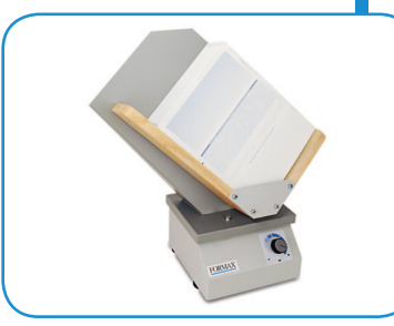
402 Series Jogger - an option which reduces static electricity from forms and aligns them for proper feeding

MyBinding.com 5500 NE Moore Court Hillsboro, OR 97124 Toll Free: 1-800-944-4573 Local: 503-640-5920