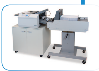
FD 2054 in-line with optional V-Stack36 Vertical Stacker, stand and cabinet

MyBinding.com 5500 NE Moore Court Hillsboro, OR 97124 Toll Free: 1-800-944-4573