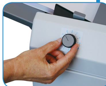
Variable speed control knob

Skew Adjustment: Adjusts feed table left or right for crisp, accurate folds