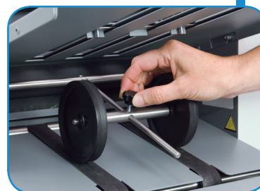
Adjustable stacker wheels help to keep folded documents in a neat stack

MyBinding.com 5500 NE Moore Court Hillsboro, OR 97124 Toll Free: 1-800-944-4573 Local: 503-640-5920