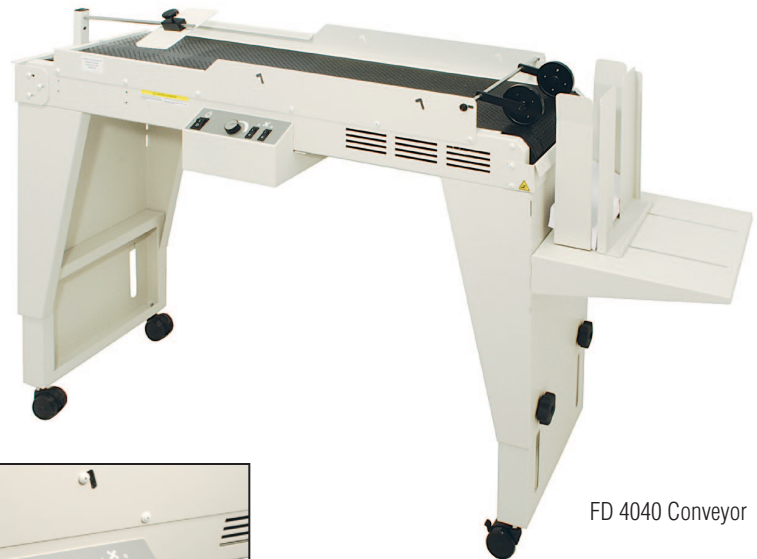
FD 4040 Conveyor