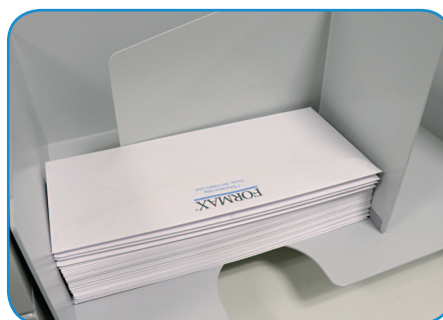
Adjustable outfeed tray accommodates a wide variety of envelope sizes, keeping them neatly stacked after sealing