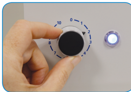
Variable speed control knob