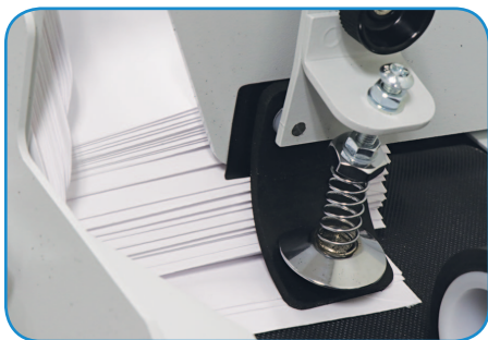
Envelope separator ensures single feeding

Options: FD 430-10 Extended Sealing Kit for flaps up to 4" long, FD 430-20 Square Flap Moistening Basin and Roller