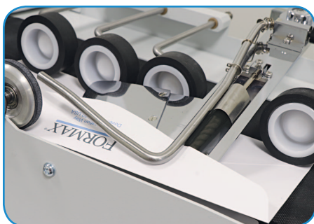
Precision moistening roller and flap closing bar accurately seal stacked or nested envelopes in a single pass