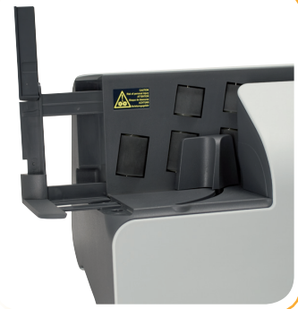
Easy-to-use support arm extends to hold large envelopes