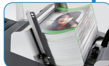
High-Capacity Versatile Feeders