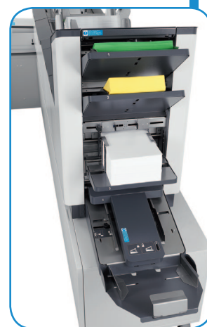
Tower Feeder w/ High-Capacity Trays and Accumulation/Divert Deck

* Paper & envelope specifications may vary. All media must be tested.