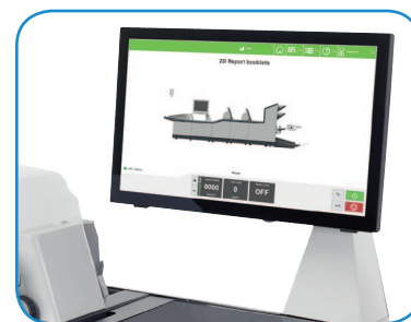
Color Touchscreen Interface

Custom Cabinets: Ergonomically designed, moveable storage