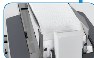
High-Capacity Envelope Feeder