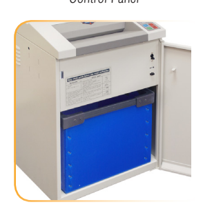
Heavy Duty Waste Bin