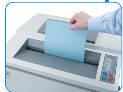
Standard Infeed accommodates up to 24 sheets at once

MyBinding.com 5500 NE Moore Court Hillsboro, OR 97124 Toll Free: 1-800-944-4573 Local: 503-640-5920