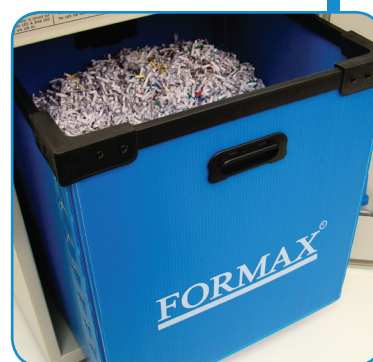
Lifetime Guaranteed Heavy-Duty Waste Bin