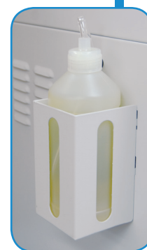
Optional EvenFlow™ Automatic Oiling System

MyBinding.com 5500 NE Moore Court Hillsboro, OR 97124 Toll Free: 1-800-944-4573 Local: 503-640-5920