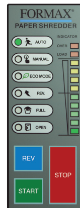
Easy-to-use control panel with Load Indicator and ECO Mode

* Sheet capacity varies depending on paper and power supply