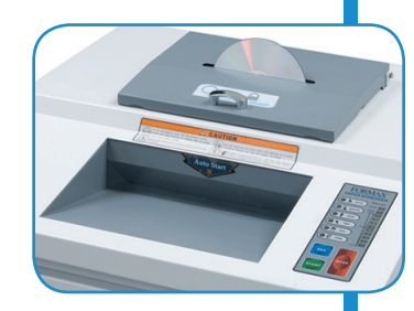
Two dedicated feed openings for paper, CDs/DVDs, USB thumb drives