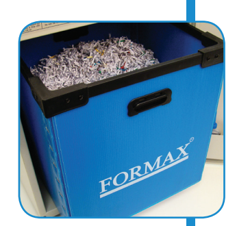
Lifetime Guaranteed Heavy-Duty Waste Bin