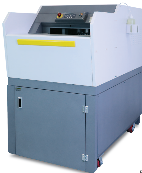
FD 8906B Industrial Shredder