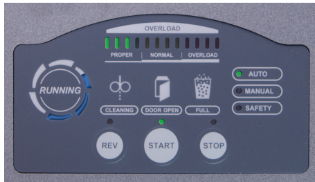
LED control panel with visual load indicator

The FD 8906B offers unmatched automated features through its LED control panel. The easy-to-read Load Indicator assists operators in determining how close they are to the maximum shred capacity to avoid jams and provide optimal efficiency. Operators can select from two modes of operation: Auto Start/Stop or Manual. Auto Start/Stop mode utilizes optical sensors which detect paper and start/stop operation automatically. The Safety Key Lock prevents unauthorized use of the shredder.