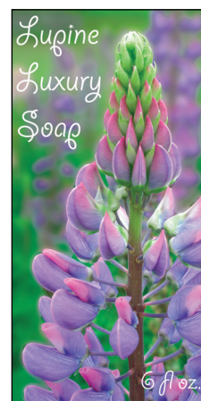
2" x 4" Specialty Product Label

MyBinding.com 5500 NE Moore Court Hillsboro, OR 97124 Toll Free: 1-800-944-4573 Local: 503-640-5920