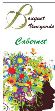
2" x 4" Wine Label