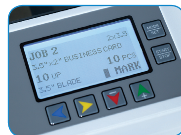
User-friendly LCD control panel