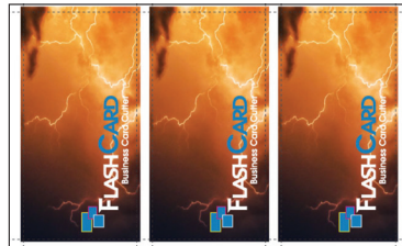
3-up 4.25" x 8" postcards Optional FC-20 - 8" Cassette