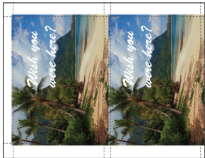
2-up 5" x 7" postcards Optional FC-10 - 7" Cassette