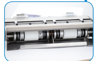
Heavy-duty cutting cassettes are interchangeable in seconds