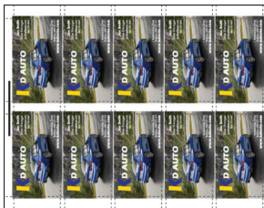
10-up 2" x 3.5" business cards Standard FC-05 - 3.5" Cassette