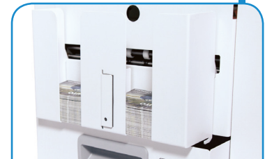
Adjustable catch tray keeps cards neatly stacked