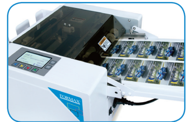
Automatic friction feed system and interlocking plexi cover