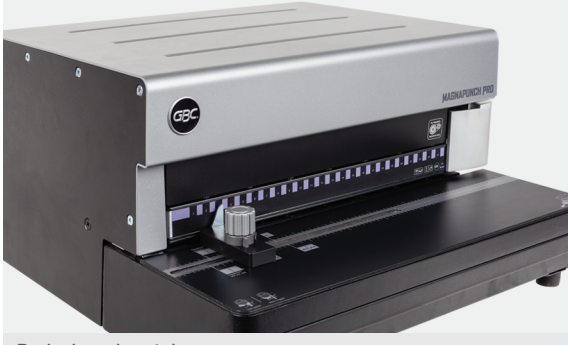
Redesigned metal cover