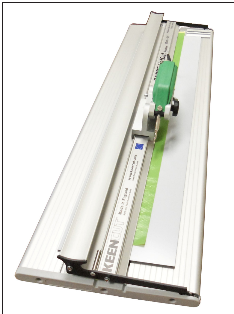
HSGM Hot Cut System. *Glass not included. 1/4" tempered glass recommended.

MyBinding.com 5500 NE Moore Court Hillsboro, OR 97124 Toll Free: 1-800-944-4573 Local: 503-640-5920