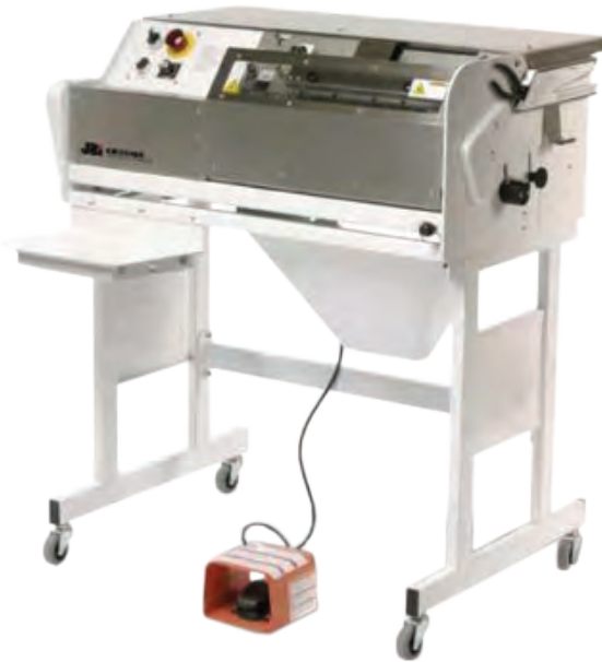
Side Lay Tool